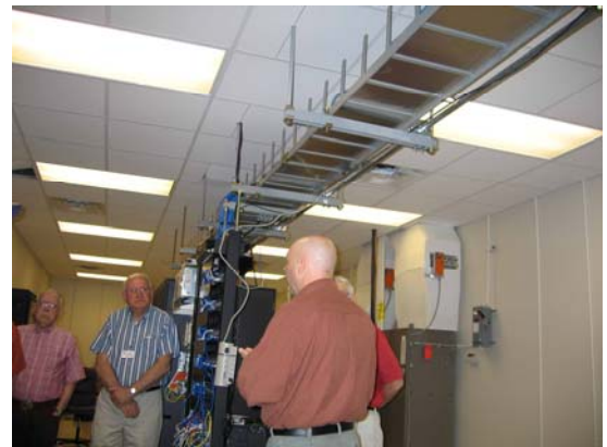
Our group on the tour