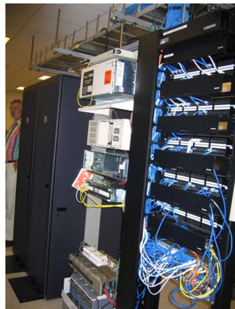
Banks of equipment and cables