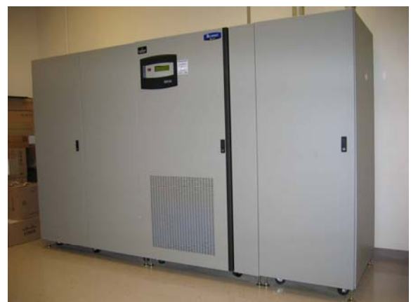
This cabinet contains over 3 miles of cables!