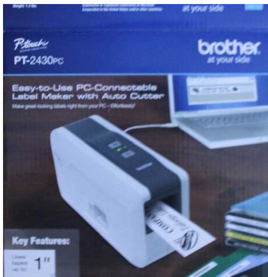
PC Connectible Label Maker