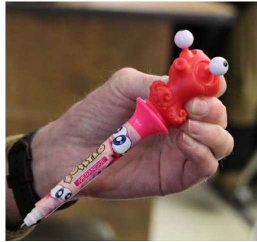
Door prize 'activated'